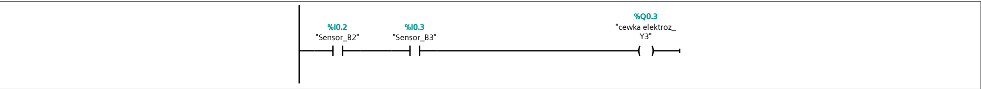
Network 3: Wysuw tłoczyska siłownika 1A3