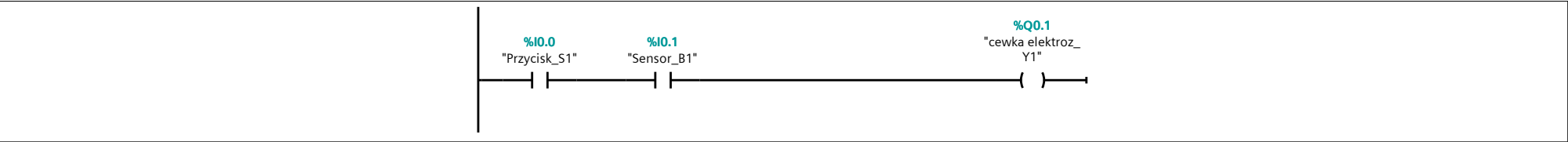
Network 2: Wysuw tłoczyska siłownika 1A2