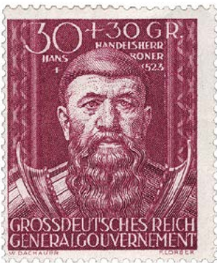
6. Jan Boner, a postage stamp issued by the General Government, 1944

The list of patrician families, especially in Cracow, which thanks to building their financial power and political influence advanced and entered the ranks of nobility, is not particularly short. This phenomenon was exceptionally frequent at the period of the last Jagiellons, before ennoblement became in the Republic extremely difficult. It is not a coincidence that the Prince of Ligne (seeking to obtain the indigenat , i.e. the recognition of his foreign nobility by the Sejm) was to say that it is easier to obtain sovereignty in Germany than nobility in Poland.