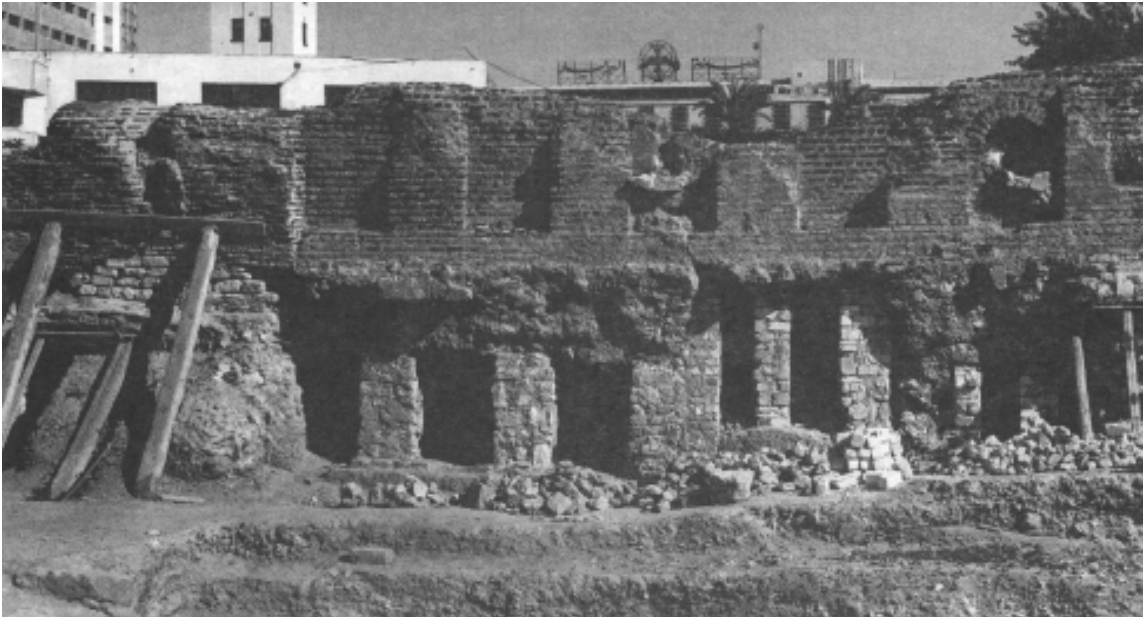
Fig. 2. Northern facade of the cistern.