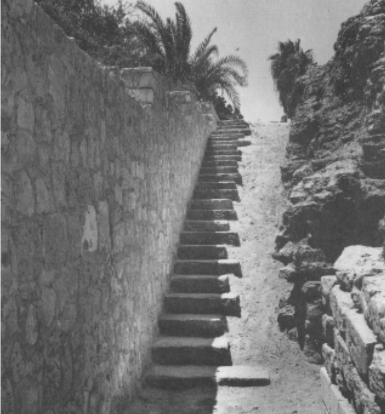
Fig. 3. New stairs and revetment wall at the southern edge of the cistern.

Clearing of the northern facade of the cistern in 1995/96 had revealed a dangerous overhanging of the upper parts of this elevation. Almost the entire length of this facade (c. 50 m 2 ) was cleared this year, providing visible proof of the fact that practically the entire cistern complex stands on top of