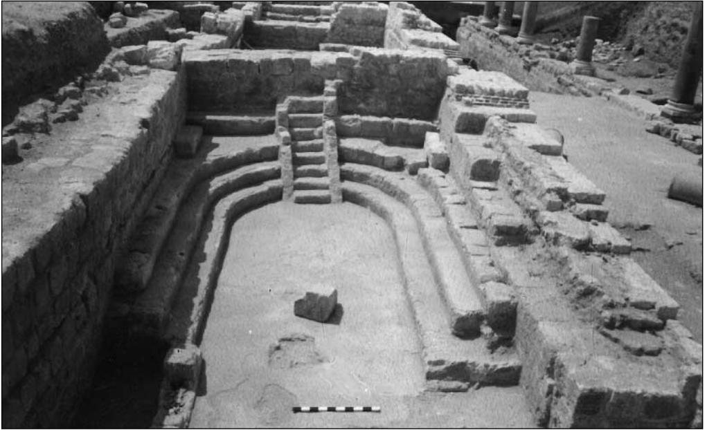
Fig. 5. Late Roman Auditorium K, view from the north