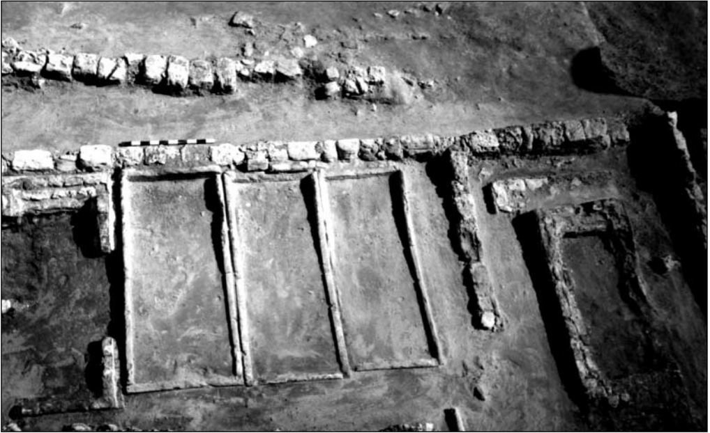
Fig. 1. Area E. Moslem Upper Necropolis, graves E 42-45. View from the west