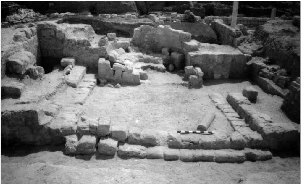
Fig. 6. Late Roman Auditorium P