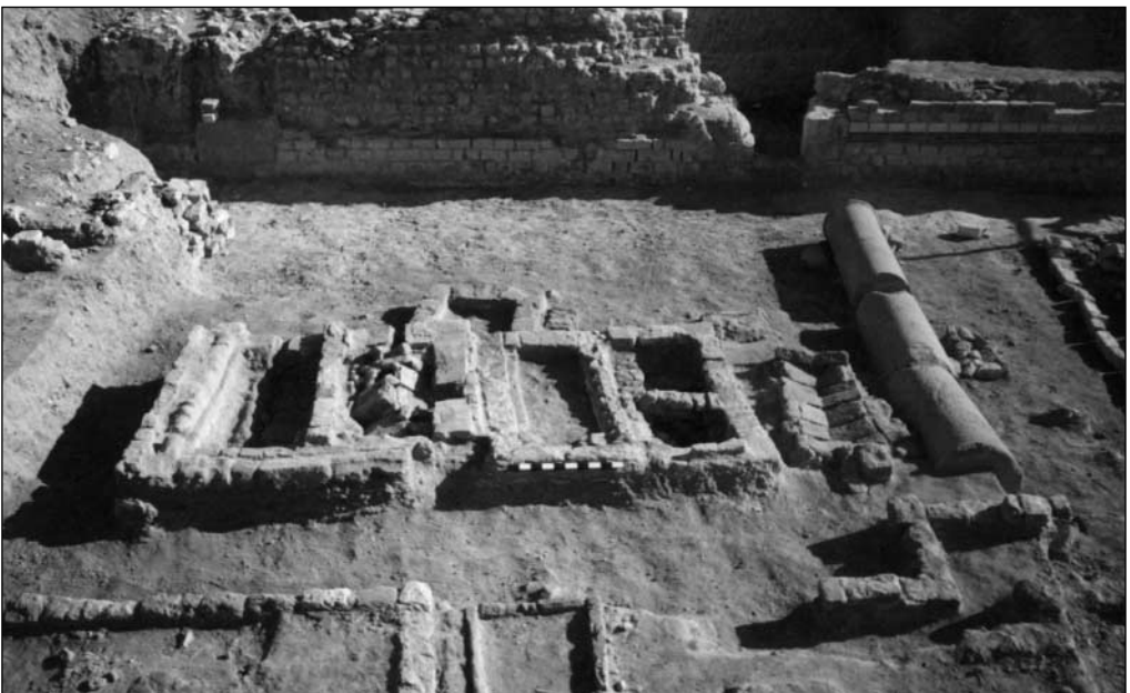
Fig. 2. Area E. Moslem Upper Necropolis, graves E 33-35. View from the west