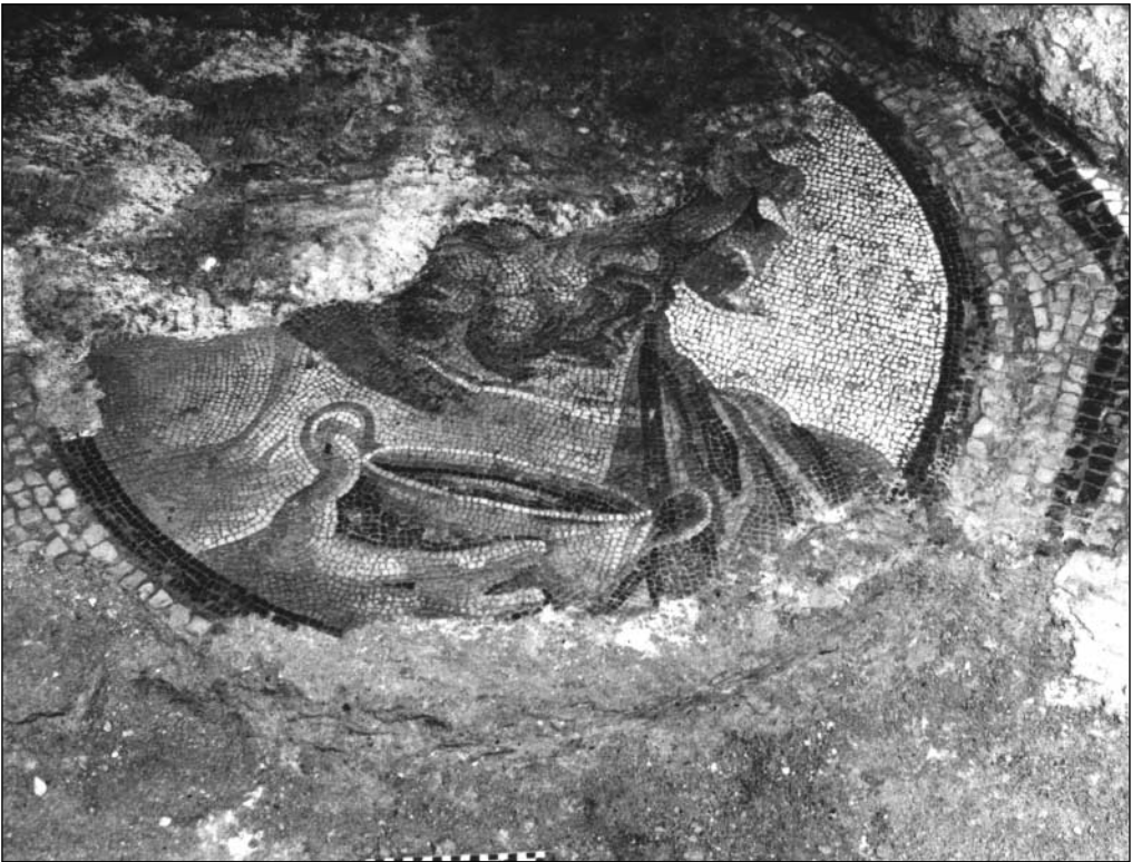
Fig. 7. Figural emblema from the mosaic found below the theatre

Finally, mention should be made of a number of artifacts found in good condition in the fill removed from a subterranean vaulted cellar in the Baths complex, excavated prior to undertaking the planned preservation work. Two glass vessels and two complete lamps were recovered from a thick layer of ashes accumulated under the vaults near the furnaces. 9) All the finds, accompanying pottery were dated to the 5th century AD and should be considered as referring to the second building phase of the Baths.