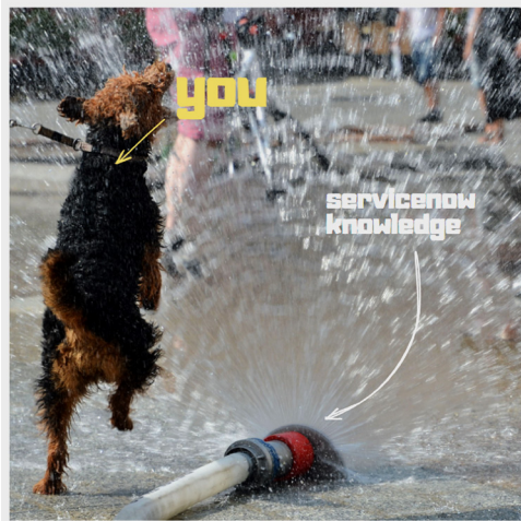
Figure 1.1: Learning ServiceNow is like drinking from a firehose

know how to search the web, you have access to all the product and release documentation, and you also have access to all sorts of training and certifications, for free in many cases.