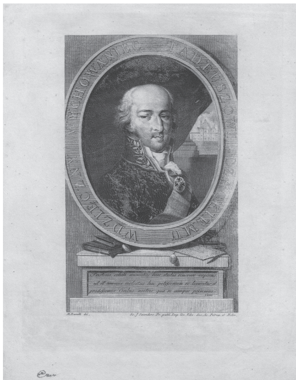
Il. 2.1. Portrait of Tadeusz Czacki. Engraving by Joseph Saunders after the painting by Matteo Baccelli. Between 1810–1813. National Library, Warsaw