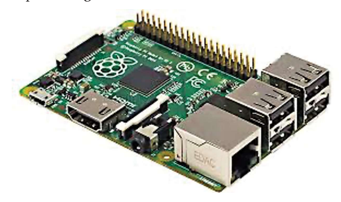
Figure 1.2: Raspberry Pi 3, Model B+, a popular single board computer

than a personal computer, it comes at a much cheaper price and drives significantly low power to operate. An SBC can draw its required power to operate from a power bank or the USB port of a computer. SBCs can easily interface with external sensors like servo motors and ultrasound sensors. They are typically used in academic projects and industrial applications where edge devices of small form factors are required to be directly connected to external devices for data collection and analysis. Figure 1.2 shows a picture of a Raspberry Pi device, a popular SBC used in various commercial applications and academic projects. The device is powerful enough to run optimized deep learning models.