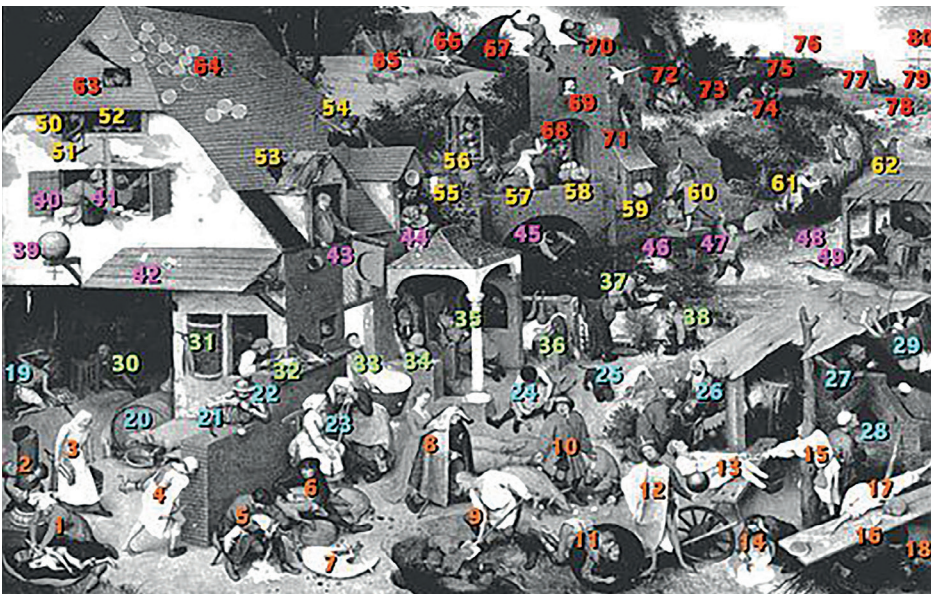
Fig. 2. The Netherlandish Proverbs ( https://upload.wikimedia.org/wikipedia/commons/thumb/c/c9/Bruegel6.jpg/500px-Bruegel6.jpg )