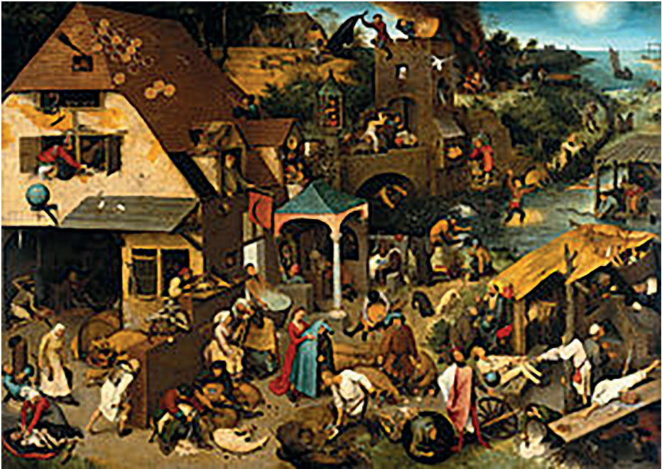
Fig. 1. Pieter Bruegel, the Elder, The Netherlandish Proverbs ( https://upload.wikimedia.org/wikipedia/commons/thumb/7/7e/Pieter_Brueghel_the_Elder_-_The_Dutch_Proverbs_-_Google_Art_Project.jpg/ )