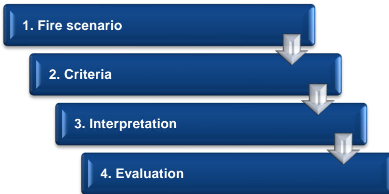
Fig. 2. Process of evaluation of construction products in terms of fire safety according to CEN procedures based on [16, 17]

The first stage – fire scenario – is the most important, because it answers the following question: what is the type of fire to be considered? The answer allows for the designing of a new experimental method or the use of an existing one to test the product or element.