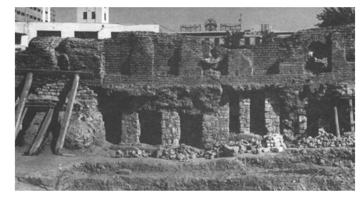
Fig. 2. Northern facade of the cistern.