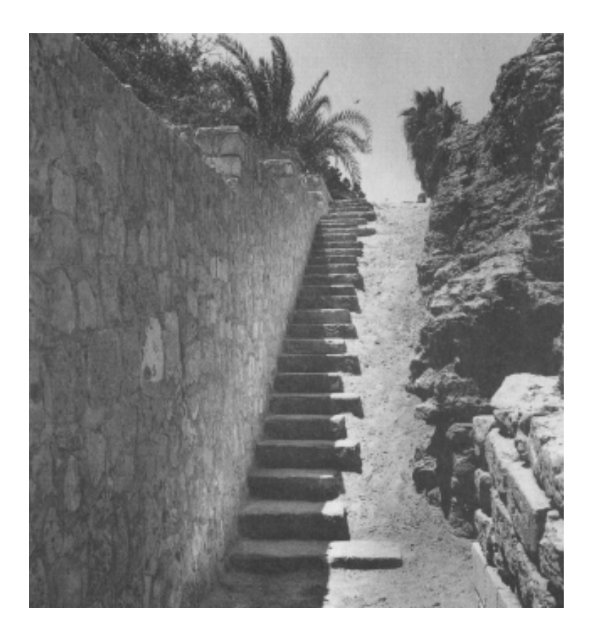
Fig. 3. New stairs and revetment wall at the southern edge of the cistern.

Clearing of the northern facade of the cistern in 1995/96 had revealed a dangerous overhanging of the upper parts of this elevation. Almost the entire length of this facade (c. 50 \text{ m}^2 ) was cleared this year, providing visible proof of the fact that practically the entire cistern complex stands on top of