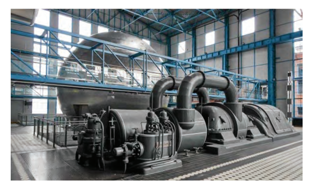
Photo 1. The historic power generator in the power station EC1, Lodz, 14/33 Kilinskiego Street, September 2015