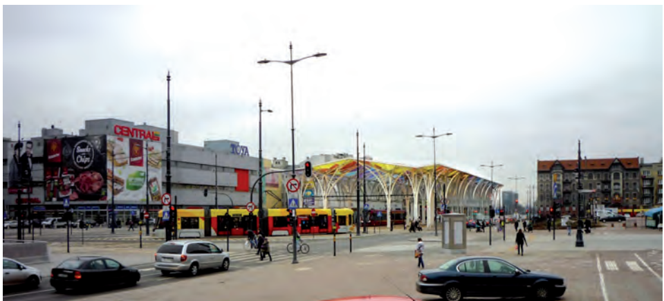
Photo 2. The example of the subject of urban decorum discussion: a tram stop, arch. J. Gałecki, Mickiewicza Street, Lodz